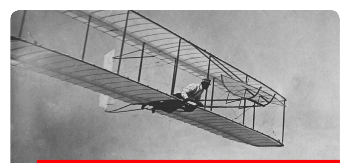
Have you analyzed your risks?